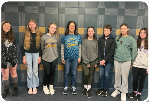
Power of the Pen Team

Regional winners will move forward to the May 12-13 in-person Power of the Pen State tournament at Otterbein University.