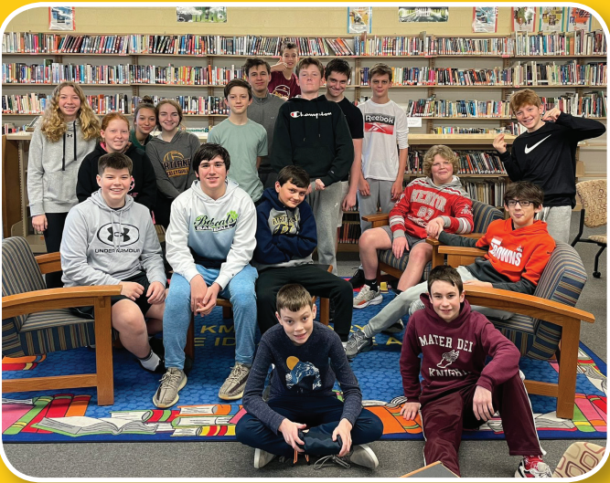
KMS students that raised the most money for LLS and enjoyed a donut party.

At Kirtland Elementary School, there will be an online contribution contest and Spirit Week in April.